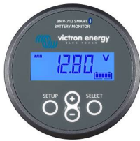
Bluetooth sensing BMV-712 Smart Battery Monitor