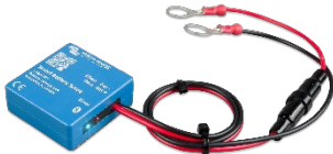
Bluetooth sensing Smart Battery Sense