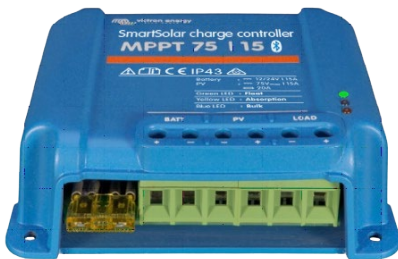
SmartSolar Charge Controller MPPT 75/15